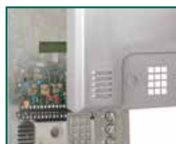
stainless steel plate and anti-vandal features