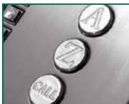
large scroll and call buttons