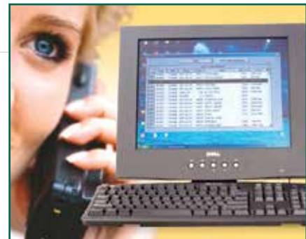
pc programmable easy to use Remote Account Manager software included